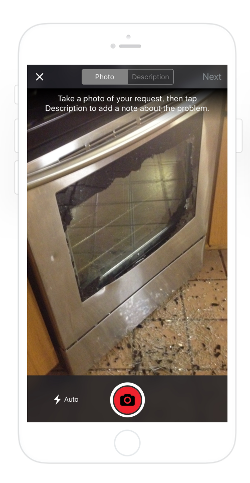
See an Issue, Take a Photo Creating service requests has never been easier.

With Resident App you can easily request service, report concerns, pay rent, receive package notifications and connect with your community team.